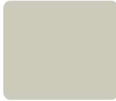
Antique Ash 3411 New