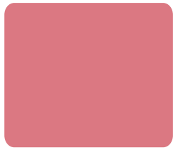
Red Rose 3020