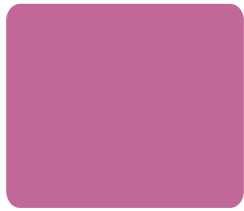
Baby Pink 3115