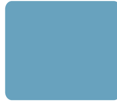
Brighto Grey 3005