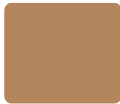
Metallic Copper 3280