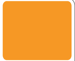
Golden Yellow 3007