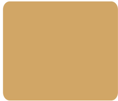
Pale Cream 3071