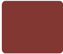
P. O. Red 3009