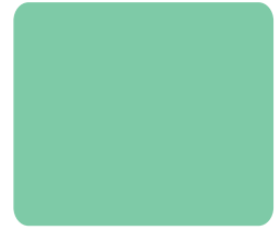
Sea Green 3027