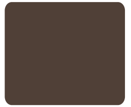
Dark Brown 3075