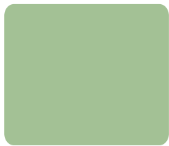
Shiny Green 3234