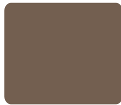
Brown Teak 3215