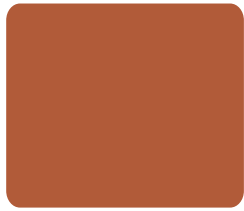
Elegant Orange 3089