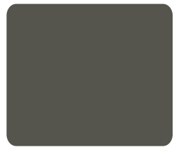
Charcoal Brown 3216

ALSO AVAILABLE IN BRILLIANT WHITE 3000 & BLACK 3102