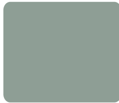
Sleek Grey 3087