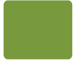
Spring Green 3028