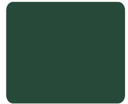
Royal Green 3041