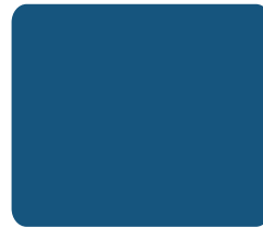
Deep Blue 3032