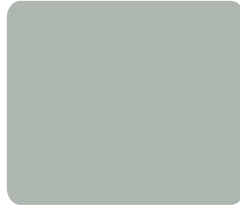
Court Grey 3080