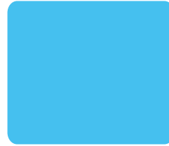
Light Blue 3016