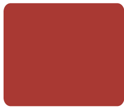
Signal Red 3008