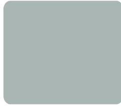
Antique Grey 3409 New