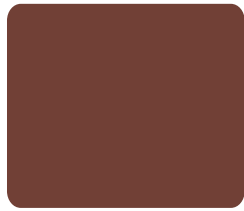
Red Oxide 3011